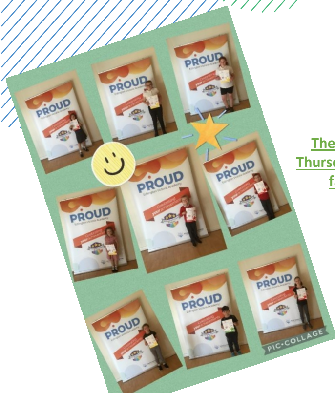
The Launch of Proud Thursday, celebrating our fantastic pupil's achievements